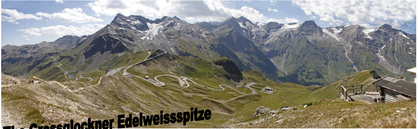
The Grossglockner Edelweiss Spitze

MY WIFE AND I HAVE PLANNED OUR TRIP THROUGH EUROPE FOR AUGUST 2012. IT WILL BE A TWO WEEK TRIP, WITH EASY OVERNIGHT B&B STOPS, MAKING OUR WAY DOWN THROUGH THE BLACK FOREST AND AUSTRIAN MOUNTAIN PASSES. STAYING FIVE NIGHTS AT THE GASTHOF HOCHALMSPITZE AUSTRIA AND PICKING THE DAYS THERE TO DO SOME OF THE FANTASTIC RIDE-OUTS IN THE AREA; OR DOING THE LOCAL SIGHTS; OR SIMPLY RELAXING. THEN TAKING OUR TIME WORKING OUR WAY BACK THROUGH EUROPE STOPPING OVERNIGHT IN SCENIC AREAS WITH TIME TO EXPLORE.